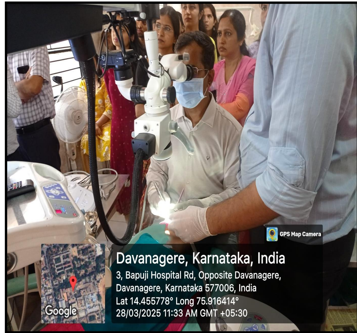
Live demonstration on a patient undergoing root canal treatment (RCT) was conducted, where he meticulously explained each step of the procedure